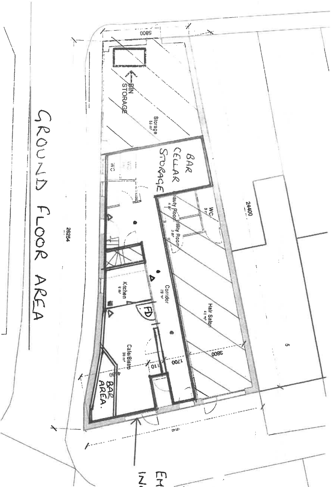
Ground Floor Plan 1:100